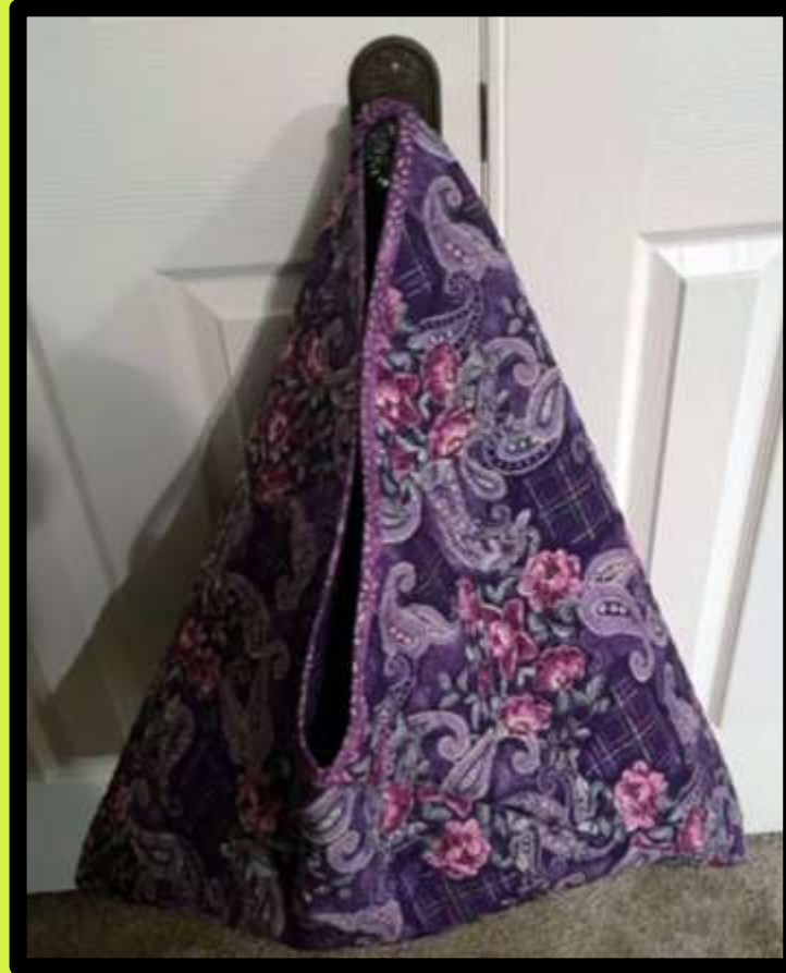
Origami hobo bag using quilted fabric